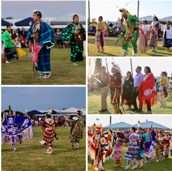
Absentee Shawnee Tribe July 4th PowWow