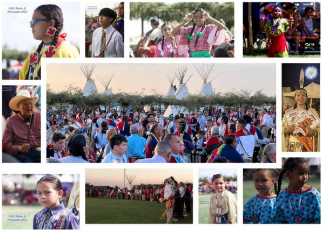
Kiowa Tribe Cultural Encampment