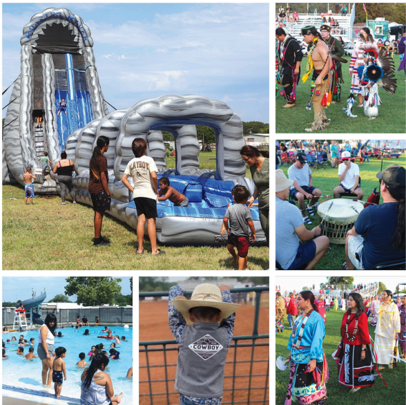
Sac and Fox Nation PowWow and Fun Day